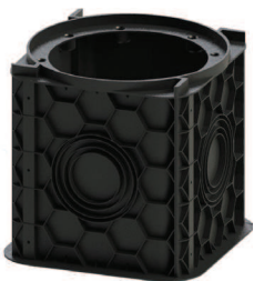
POB 30 NEW WIRING POTHOLE